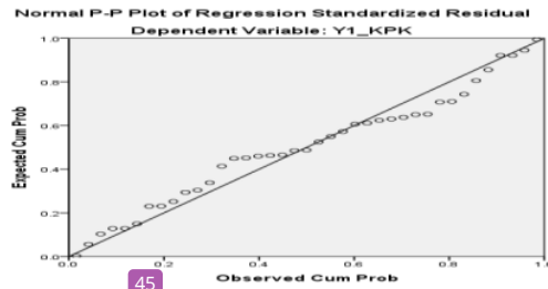
Figure 1. Normality Test Results