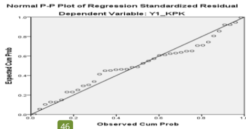
46 Figure 1. Normality Test Results