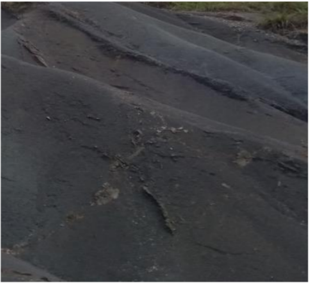
Fig 1: Visual observation of Mountain sand