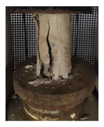
Fig 2: Compressive strength test equipment