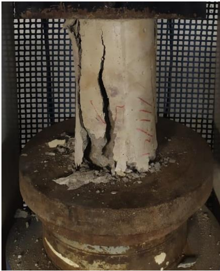
Fig 2: Compressive strength test equipment