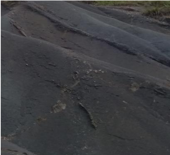
Fig 1: Visual observation of Mountain sand