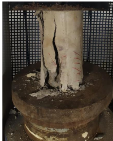
Fig 2: Compressive strength test equipment